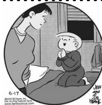
6-17 ©2012 Bill Keenan, Inc. Dist. by King Features Syndicate www.familycircus.com "Sayin' 'Amen' is like pressing the 'SEND' button for your prayers."

• Have a Birthday or Anniversary coming up?